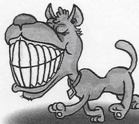
a very happy dog