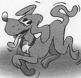
a happy dog

Words like 'totally', 'quite' and 'very' are adverbs . They're used with adjectives to show how much the adjective is working on the noun.